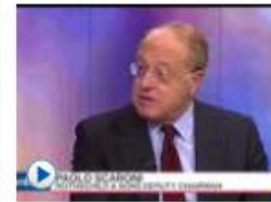
Should Oil Companies Cut Their Dividend?