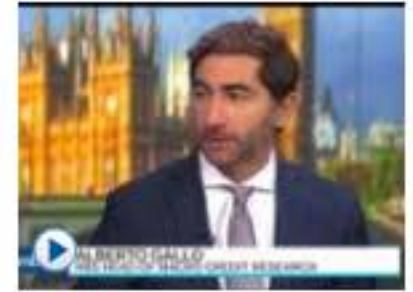
China's Choice: Devalued Yuan or