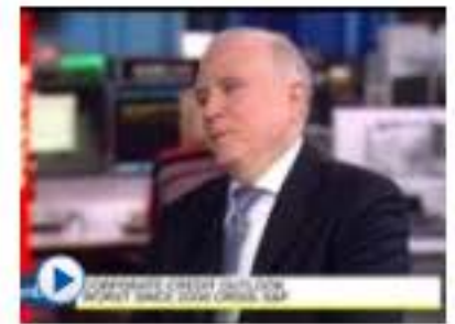
Sovereign Risk: Why Commodities Are the